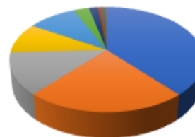
Incoming Resources 2019/20 Value